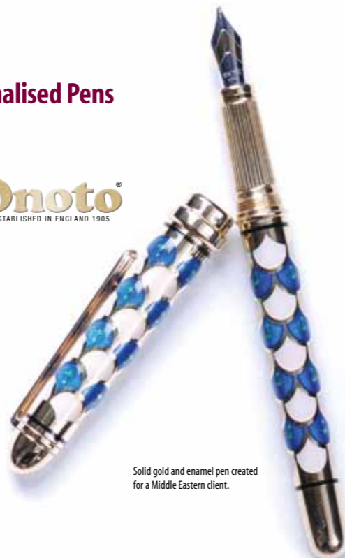
Solid gold and enamel pen created for a Middle Eastern client.