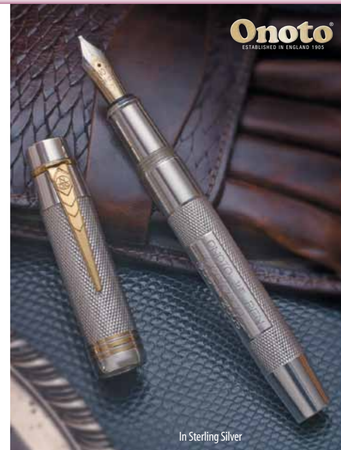
In Sterling Silver

The Onoto pens included in this booklet are fitted with either size 3 or size 7 nibs which have been created exclusively for Onoto by the world's leading nib manufacturer. As you might expect with pens of this quality, the nibs are made from 18 carat gold and are partly rhodium plated for added strength and bear an iridium tip to ensure smooth writing. Each nib bears an exclusive, engraved Onoto design and nib size. All nibs are available in a choice of fine, medium or broad styles or maybe customised to your requirements (italic, oblique, stub etc) for a nominal additional cost. See Page 13.